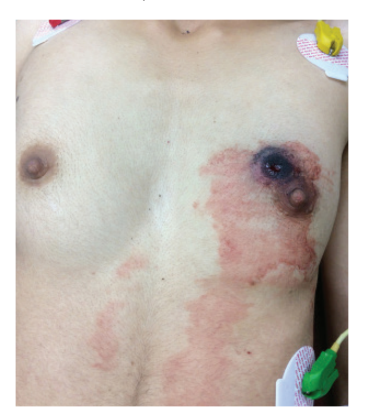
Figure 1. Morphological view of the penetrating firearm wound. Note the contact muzzle stamp around the bullet entry hole.

sixth intercostal space. Physical examination of the entry wound revealed a contact muzzle stamp over the nipple (Figure 1). Posteriorly, there was a lateral bullet exit lesion between the sixth intercostal space and the fractured seventh rib. The Computerized Tomography (CT) Angiography of the thorax demonstrated the lack of great vessel injury and the presence of a massive left hemothorax consistent with the left pulmonary parenchymal injury (Figure 1). There was an interesting patchy opaque extravasation around the pericardium near the cardiac apex which might be related to a cardiac injury (Figure 2). Thus, the patient was taken to the operating room urgently. Following a median sternotomy, the pericardium was dissected 1 cm long to explore and see the pericardial